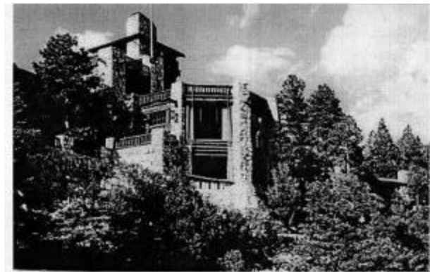
The original North Rim Lodge.

Guests Flee As $500,000 Fire Razes Big Resort Two Deluxe Cabins Also Destroyed Tillotson Flies Over Big Chasm To Direct Fire-Fighters