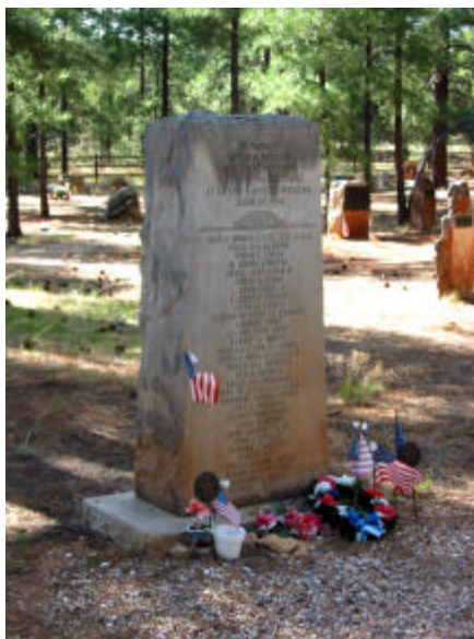
Memorial to victims.

In all, 128 passengers and crew died in what was then the world's worst aviation disaster. The 70 TWA victims were buried in a communal plot at the Flagstaff Cemetery, while the remains of 29 of the unidentified United dead were buried in the Grand Canyon Pioneer Cemetery. A monument, put in