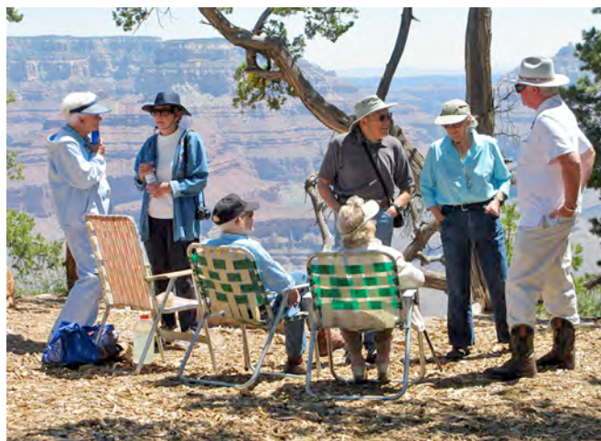
Picnic at Shoshone Point