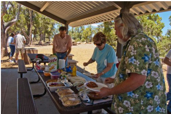
Members Enjoy Picnic Goodies at Shoshone Point

The annual Grand Canyon Historical Society picnic was held on Saturday, July 16th at Shoshone Point on the South Rim. We had 15 members in attendance and all had a good time. The facilities at Shoshone Point have recently been upgraded and now include a very nice large covered ramada with a cement floor and new picnic