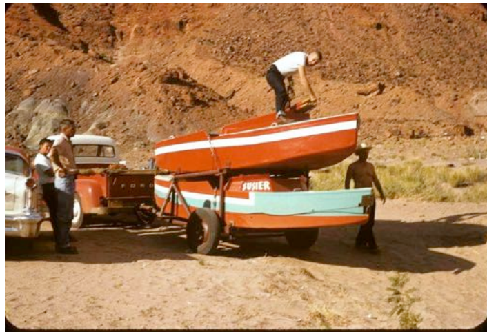
1950s Boats Built by P.T. Reilly (come see the replicated trailer)

these boats are replicas of craft that first ran in the mid-1950s and early 1960s. Back then, river pioneers P.T. "Pat" Reilly, Moulty Fulmer, Martin Litton and Brick Mortenson designed and built boats that established the traditions and type of hard hulled craft, called dories, used today on the Colorado. No need to sign up to visit the put-in.