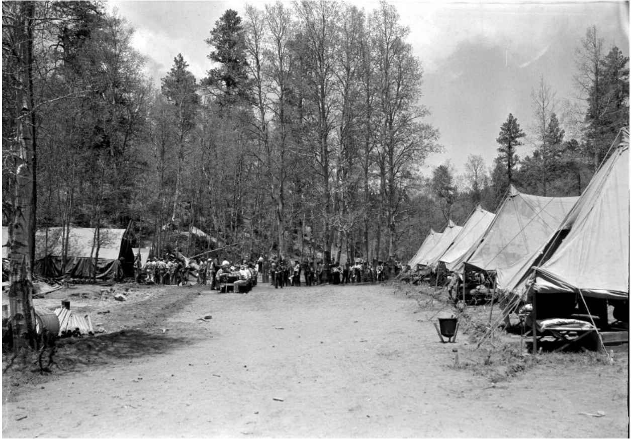
#06052A: CCC CAMP AT NEAL SPRINGS, NORTH RIM, 1933.