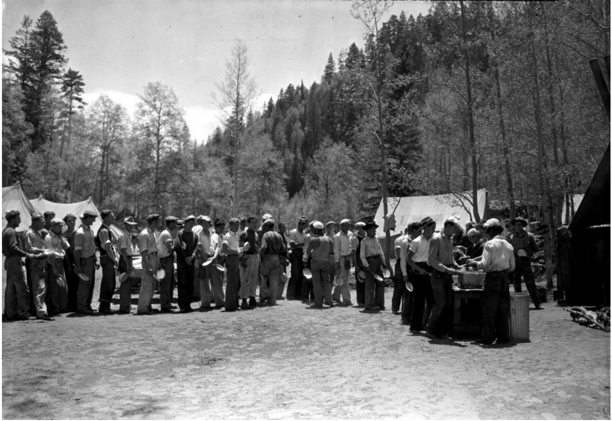
#07890: CCC ENROLLEES LINING UP FOR A MEAL AT THE NEAL SPRINGS CAMP, JUNE 1933.