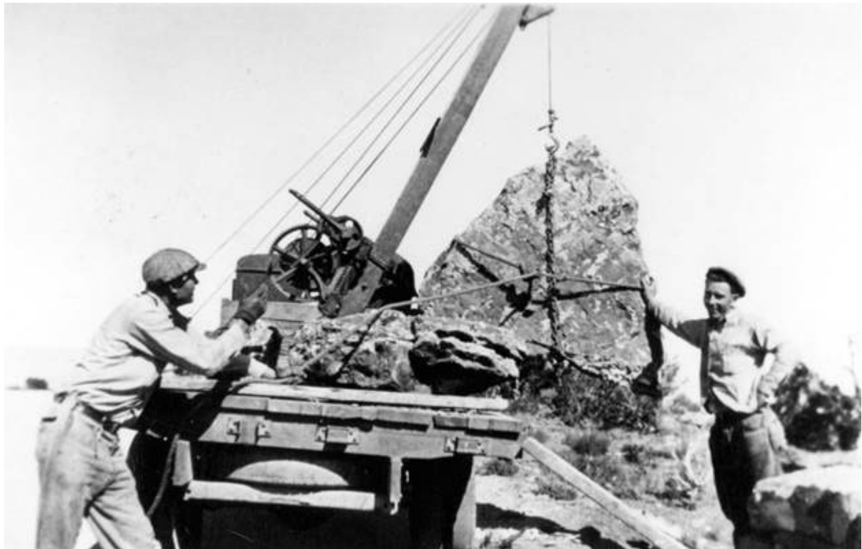
#16978: MEN USING WINCH TO PUT ROCKS IN PLACE DURING WATCHTOWER CONSTRUCTION, CIRCA 1932.

I remember when she was planning the Watchtower... She was very particular about how the rocks should be placed around the base of it, very particular. But she had everybody working for her, everybody was behind her, there her workmen were all devoted... Oh, she was very meticulous.