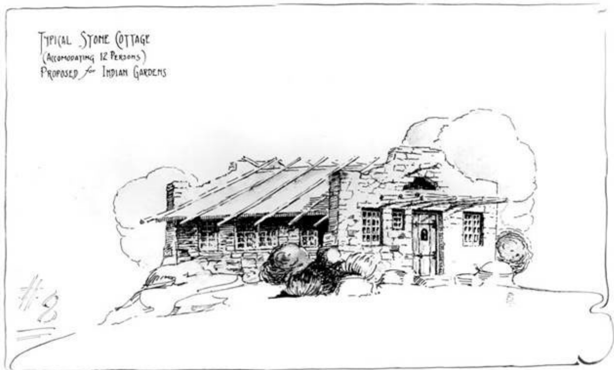
#16682: MARY COLTER DRAWING OF PROPOSED INDIAN GARDEN STONE COTTAGE ACCOMODATION.