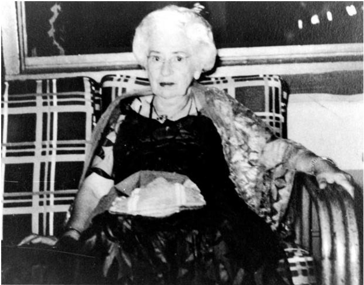
#16944: MARY COLTER, AGE 80, AT THE LA FONDA HOTEL, SANTA FE, NEW MEXICO.