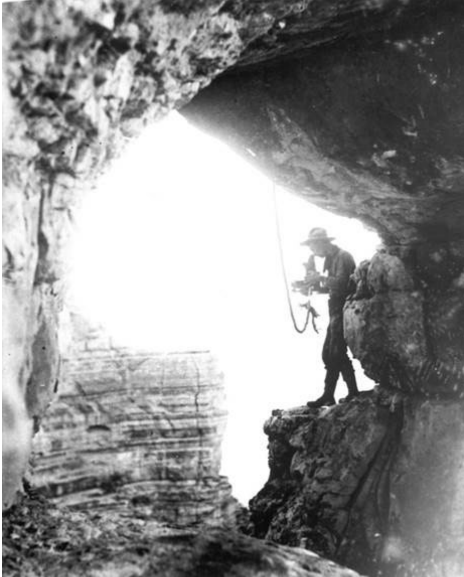
#16681: EMERY KOLB WITH ROPE & CAMERA AT MOUTH OF CAVE, POSSIBLY CHEYAVA, CIRCA 1908