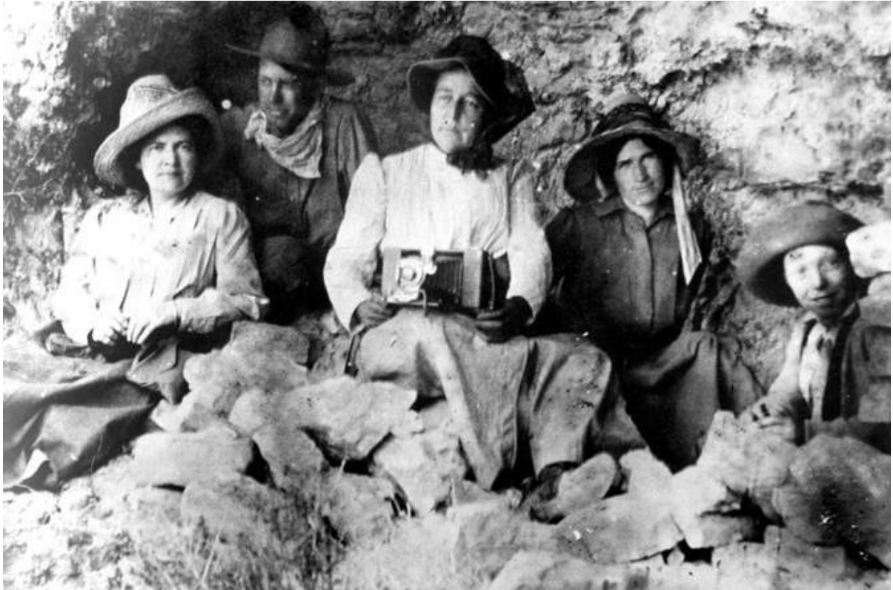
#17794: GUESTS OF W.W. BASS NEAR BASS CAMP, CIRCA 1900

Grand Canyon and cameras just naturally go together. To commemorate National Camera Day , a series of images depicting a ‘perfect shot’ of someone else getting a ‘perfect shot’ in the grandest of places :