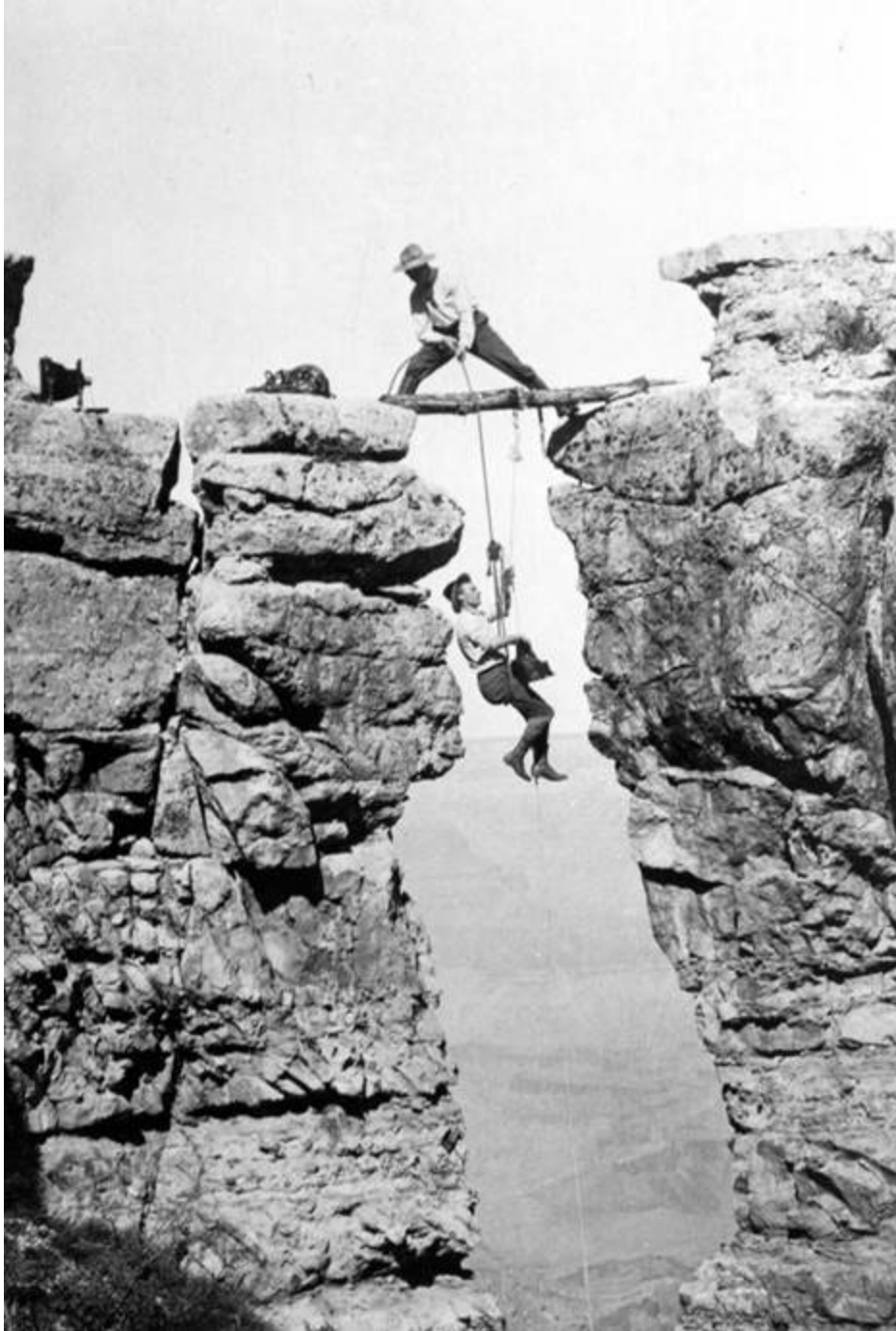
#17185B: PROMOTIONAL PHOTO OF ELLSWORTH KOLB HOLDING A GRAFLEX CAMERA WHILE SUSPENDED MID-AIR BY A ROPE BEING HELD BY EMERY, CIRCA 1908.