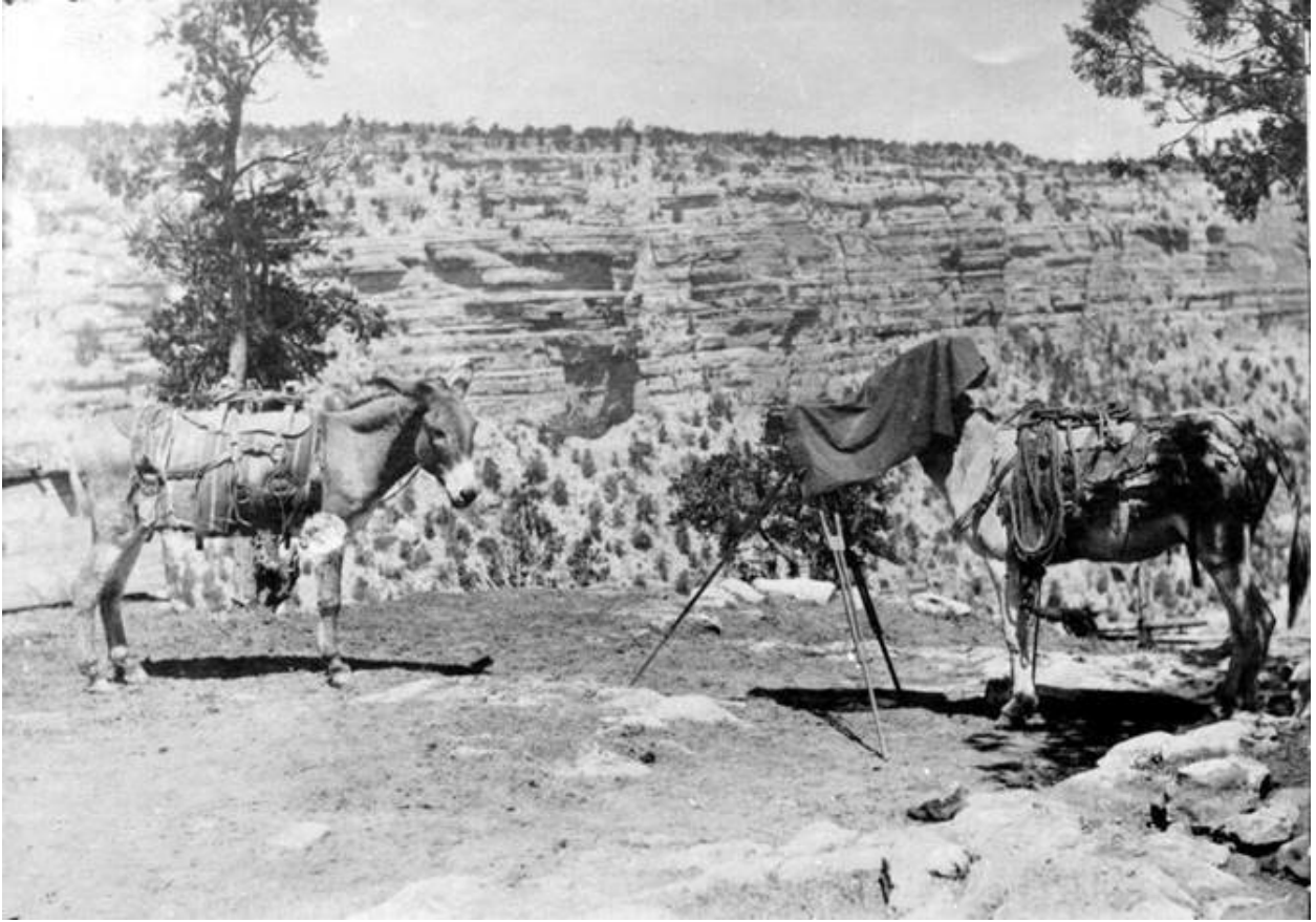
#16411: MULES TAKING PHOTOS OF EACH OTHER, CIRCA 1910.