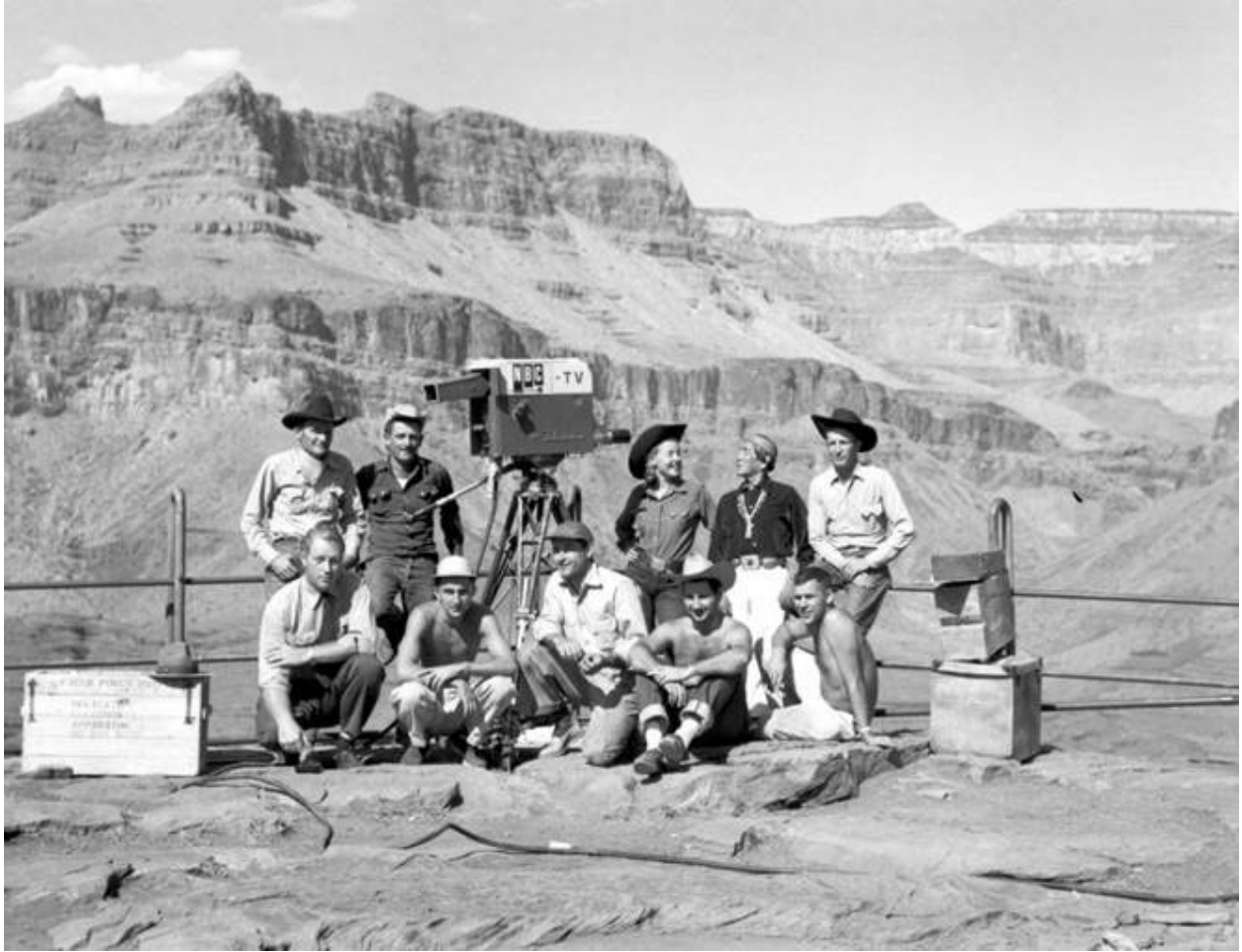
#03827: NBC-TV GROUP FILMING AT PLATEAU POINT, OCTOBER 1955

And no Grand Canyon photo essay would be complete without some Kolb Brother images.