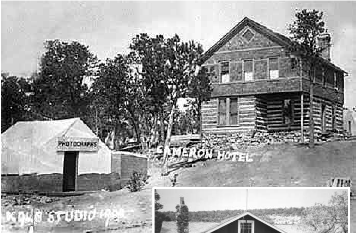
Kolb Studio, 1903

[Photo from GCHS Metzger Collection , Item: 2222 – Call No.: NAU.PH.90.9.341]