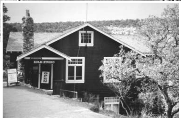
Kolb Studio, 2003