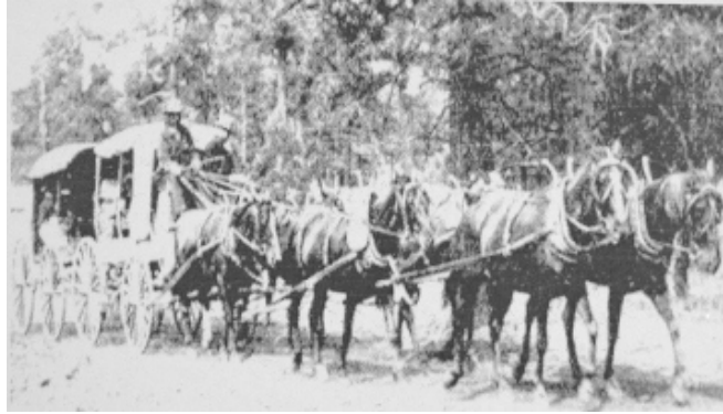
On the way

After what seemed like forever your driver stopped at what was called The Cedars to change the team and give you a chance to get a bite to eat before you headed out along the dusty trail again. It was late afternoon before you once again entered pine trees and circled up to what looked like a cabin surrounded by white canvas tents. The driver announced, "You are now at the Grand Canyon." You jumped out of the dusty wagon and began to look around. Where was the canyon that you came all this way to see?