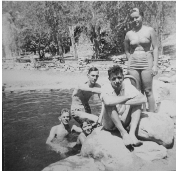
Phantom Ranch pool with one of the twins in the water. (Don't know the other people.)