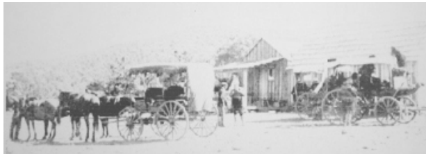
The halfway stop

In the early spring or fall when the evenings were a little too cool to sit on the porch and talk, the fireplace was a good place to gather and listen to the wild tales that