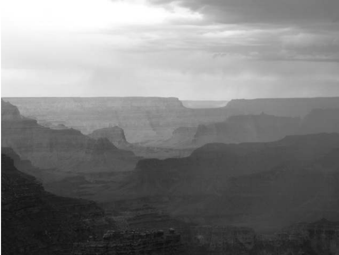
View from Yavapai Point on June 11 at 12:00 Noon [from NPS web cam at http://www2.nature.nps.gov ]

Arriving at Shoshone around 10:30, Mike and Linda Anderson began setting up the tables with the table cloths and unloading the charcoal and cooler. It was windy and the thunder was all around; but the clouds would blow over, allowing the sun to peek out now and then. This went on for some time until it finally decided to rain around 11:15...and it rained - a lot!