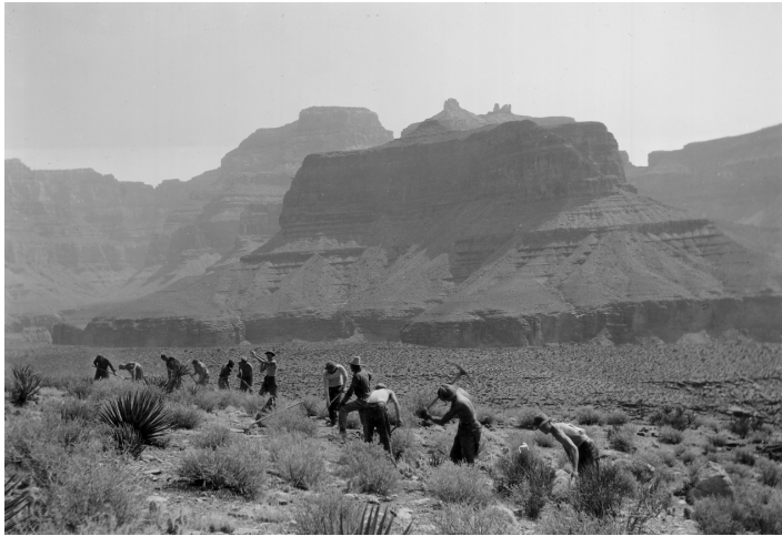
CCC Workers on the Clear Creek Trail