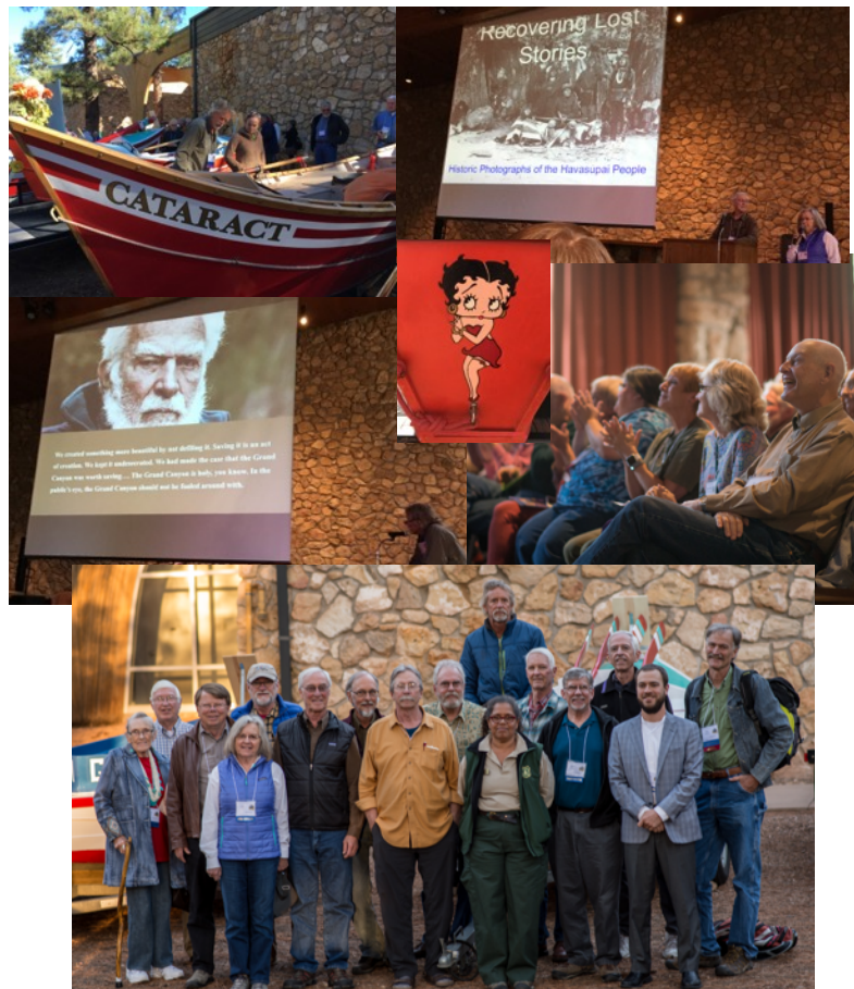
Boats, Talks, Group Photo of Presenters