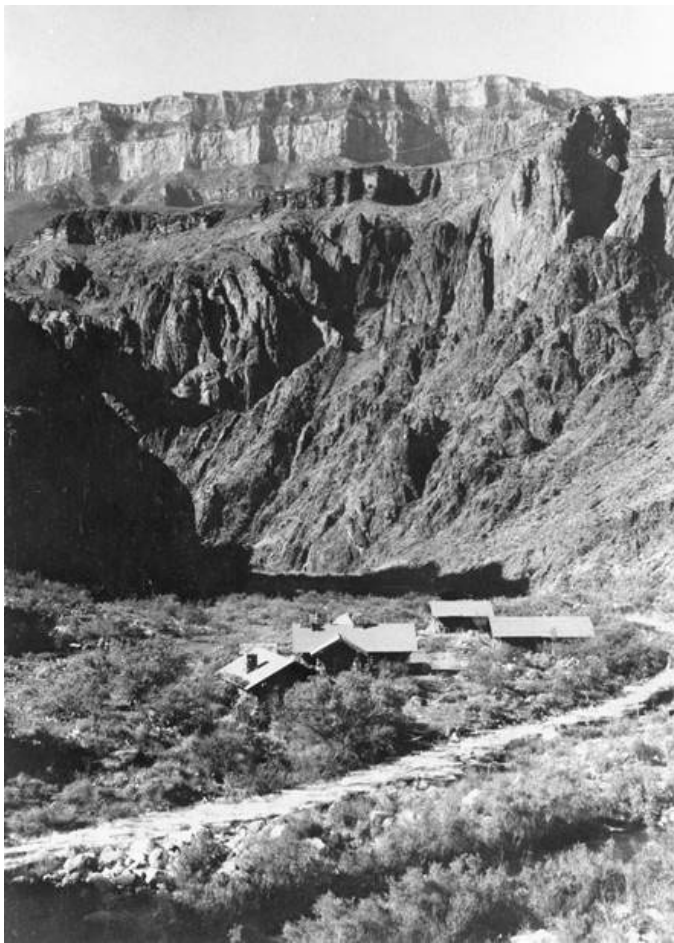
#10059: PROMOTIONAL PHOTO OF ORIGINAL PHANTOM RANCH BUILDINGS AND BRIGHT ANGEL CREEK, CIRCA 1922