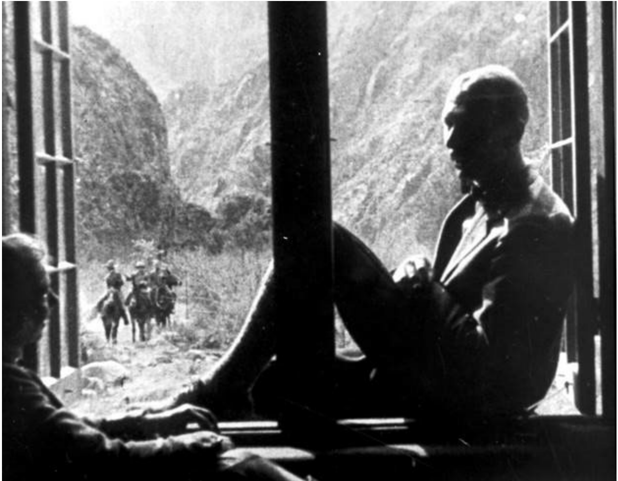
#13913: PHANTOM RANCH EMPLOYEES AWAITING MULE RIDERS, 1922