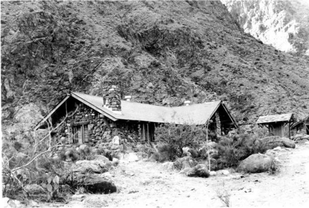
#04439: ORIGINAL PHANTOM RANCH LODGE BUILDING AFTER CONSTRUCTION, CIRCA 1922.