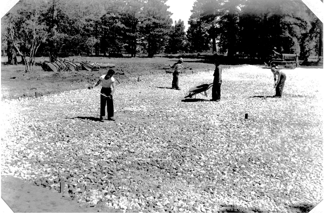
GRCA 29853: NORTH RIM TENNIS COURTS, CONSTRUCTING THE SUB-SURFACE, SUMMER 1936

The playing surface covers an area 105'x120'. Particular care was taken in the preparation of the subbase, and the laying of the surface material.