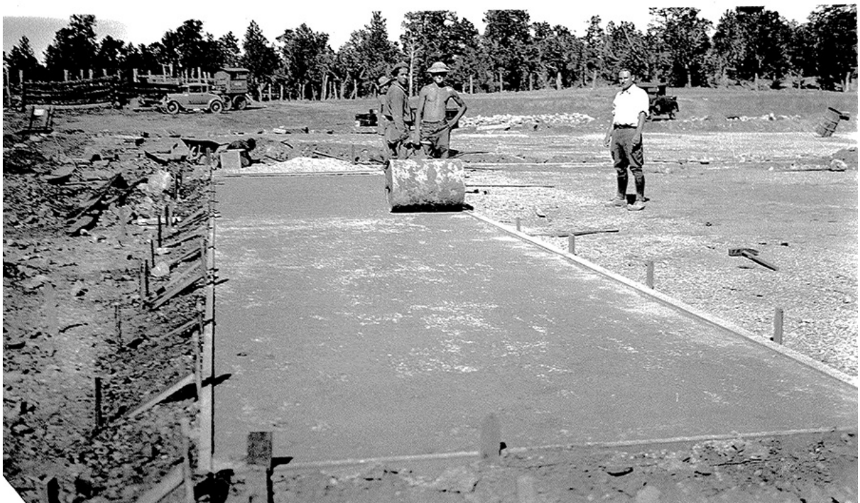
GRCA 29861: TENNIS COURT CONSTRUCTION, ROLLING FINISHED BASE, 1933