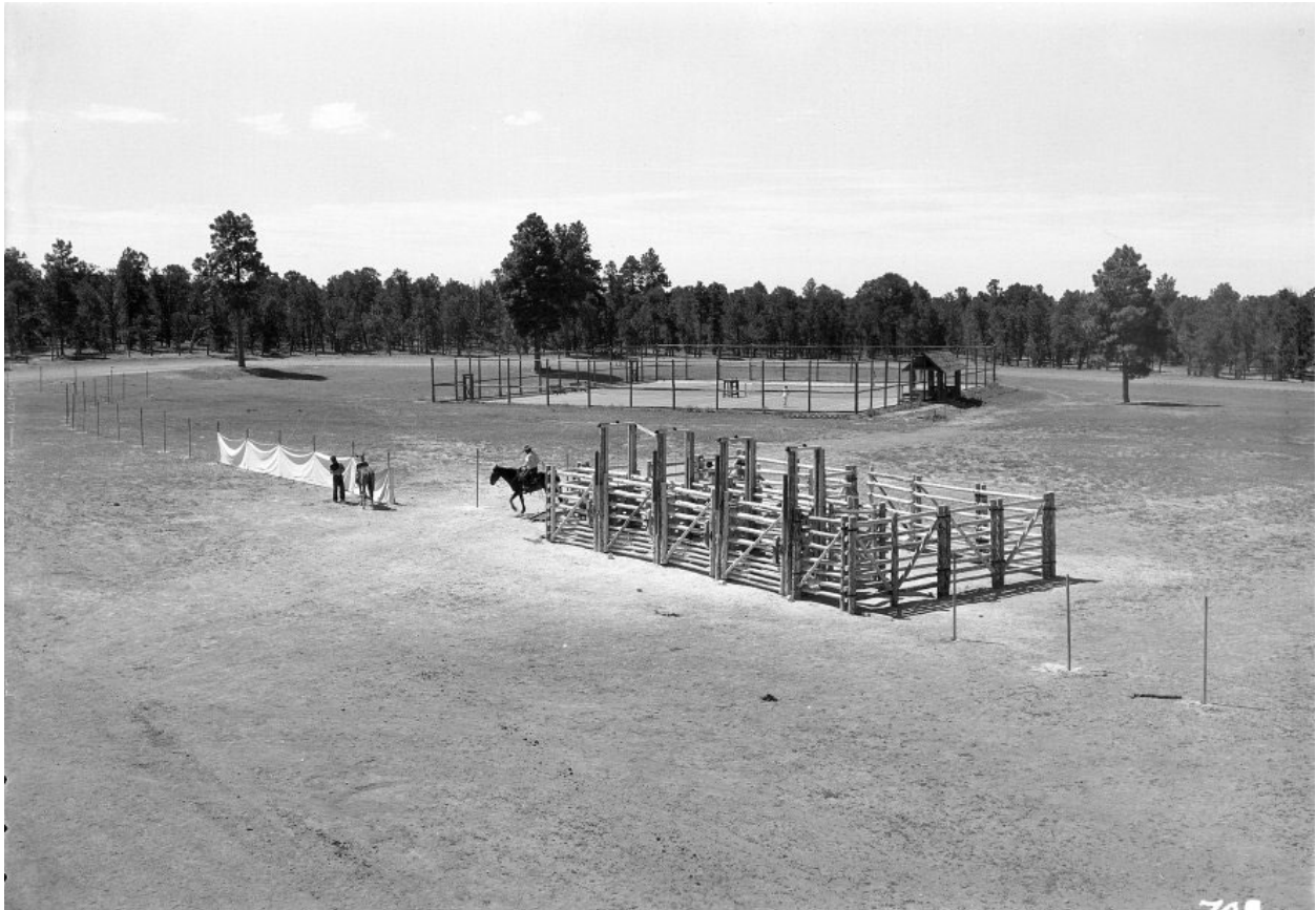
#00700: COMPLETED RODEO CHUTES AND CORRALS AND TENNIS COURTS IN THE COMMUNITY FIELD, JULY 1935

“This project consisted of completely rebuilding the battery of two tennis courts located in the recreational area [on the South Rim].