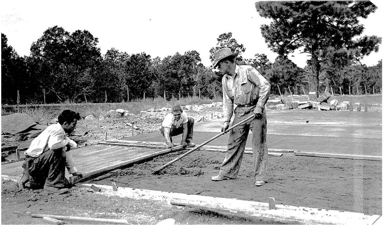
GRCA 29861: TENNIS COURT CONSTRUCTION, LAYING THE LAYKOLD BINDER, 1933