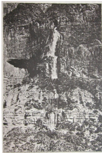
Cheyava Falls

An urge to visit and photograph the remote and undiscovered sections of the Colorado River canyons was early acquired by my