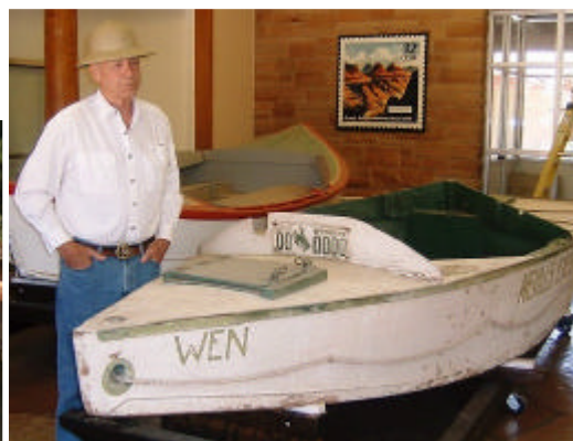
The WEN , a cataract boat built and used by Norm Nevills between 1938 and 1949.