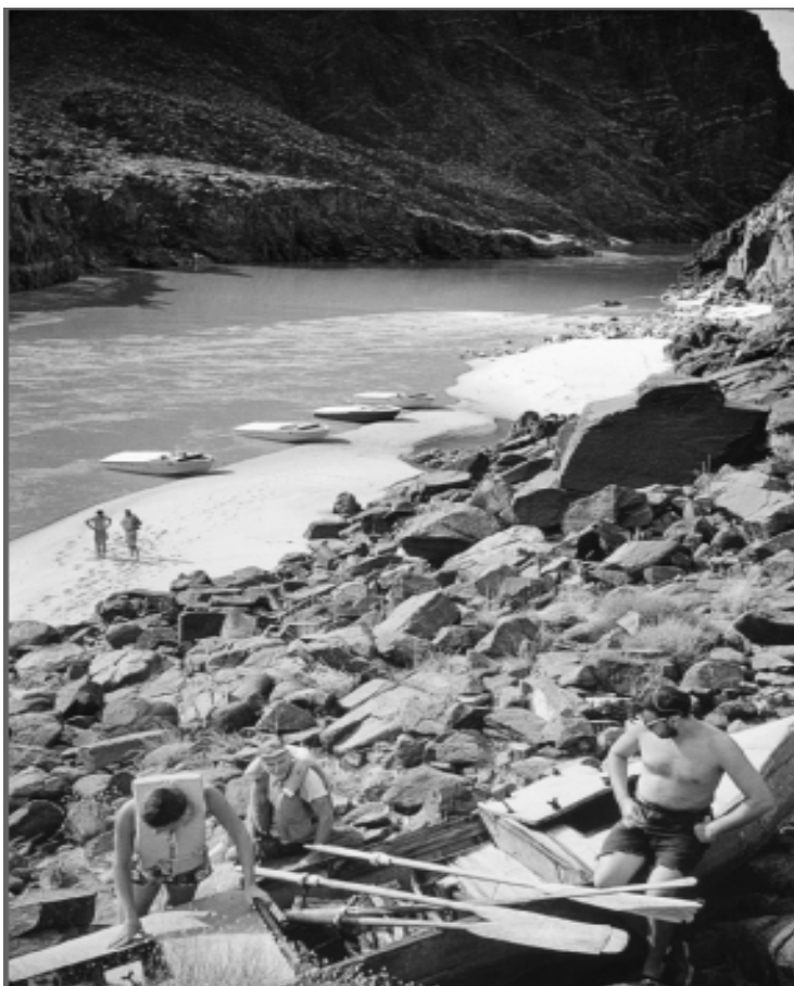
taken in 1960, of the Loper boat "Ross Wheeler."