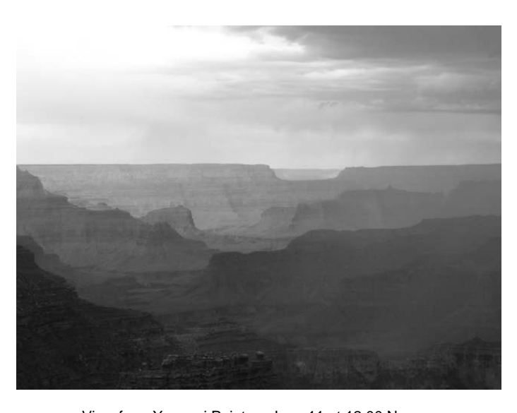
View from Yavapai Point on June 11 at 12:00 Noon

Arriving at Shoshone around 10:30, Mike and Linda Anderson began setting up the tables with the table cloths and unloading the charcoal and cooler. It was windy and the thunder was all around; but the clouds would blow over, allowing the sun to peek out now and then. This went on for some time until it finally decided to rain around 11:15...and it rained - a lot!