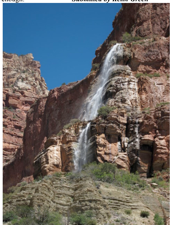
Cheyava Falls, Spring 2010

Cheyava Falls flows from a cave about halfway down the Redwall, up an arm of Clear Creek Canyon, and only flows when the snow is melting on the North Rim. This was such a heavy snow year that Cheyava has been flowing for more than a month. It can be seen from many places on the South Rim if it is still running strong enough. Submitted by Keith Green