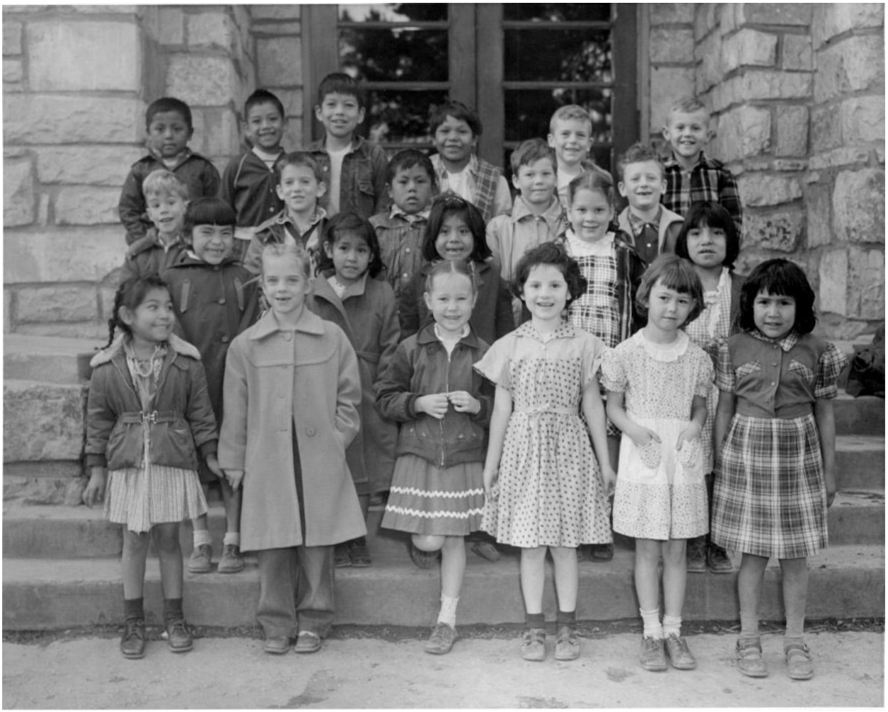
#02428: First grade, Grand Canyon School, February 1953.