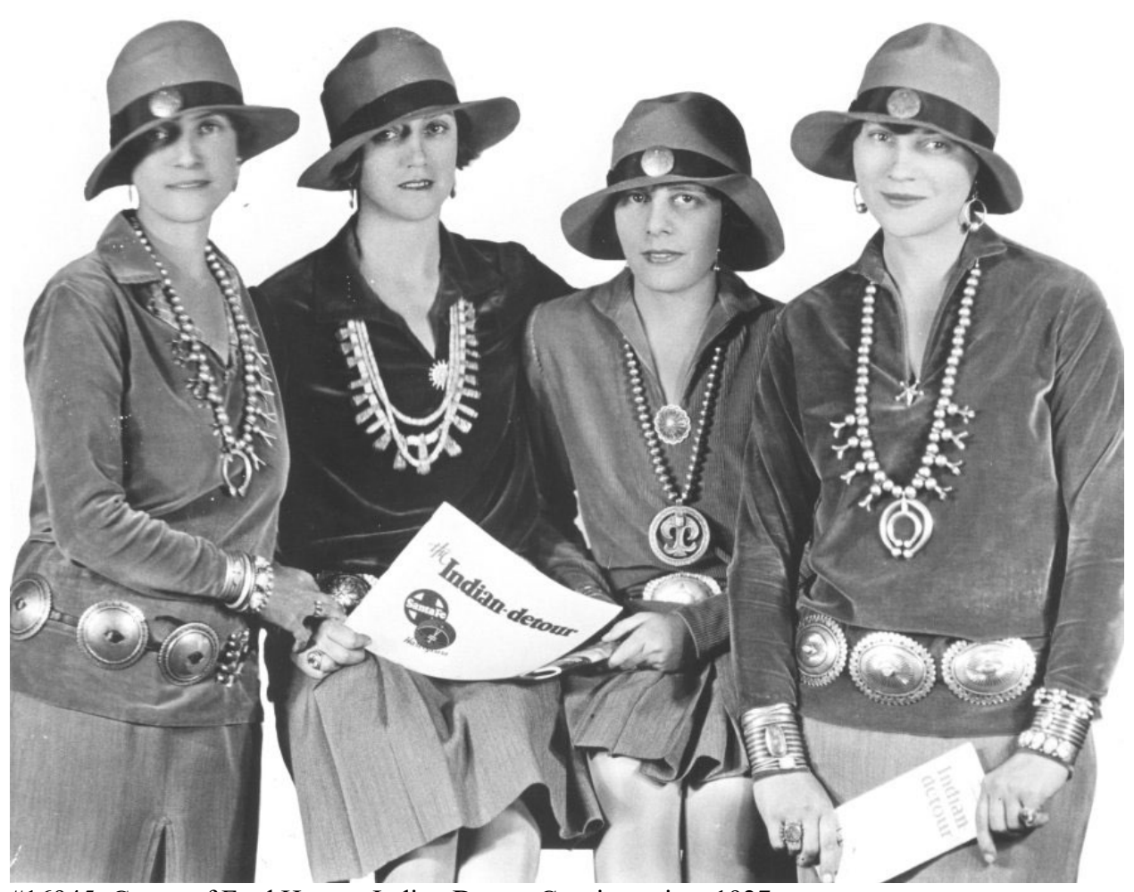
#16945: Group of Fred Harvey Indian Detour Couriers, circa 1927.