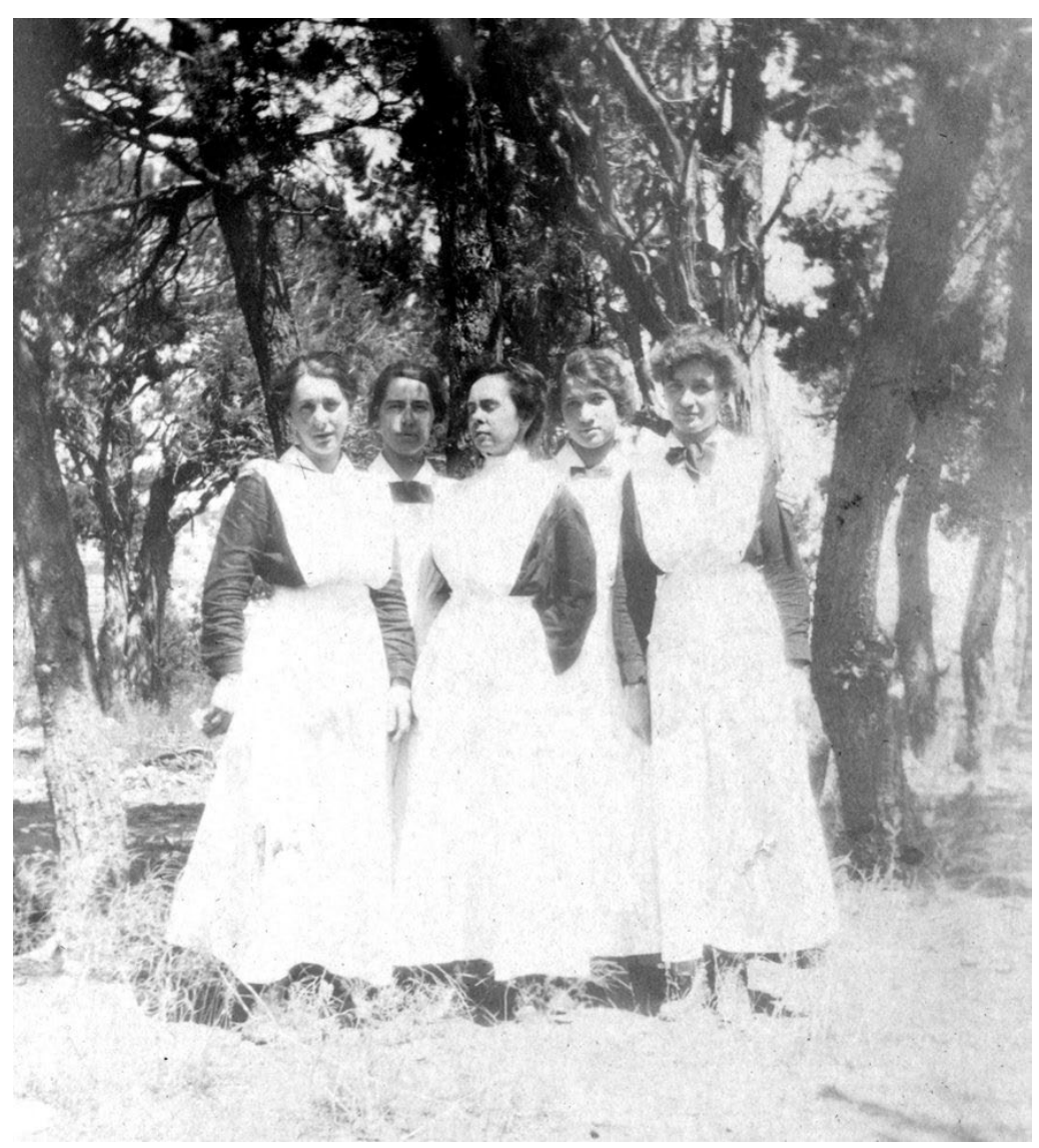
Harvey Girls at Grand Canyon, circa 1906.

Inspired by NPS Fashion Week, here's a pictorial of Grand Canyon concessioner uniforms through the years: