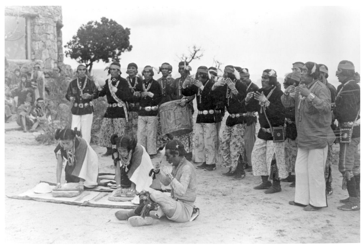
#05424a: Hopis at the Desert View Watchtower dedication ceremony, May 1933.