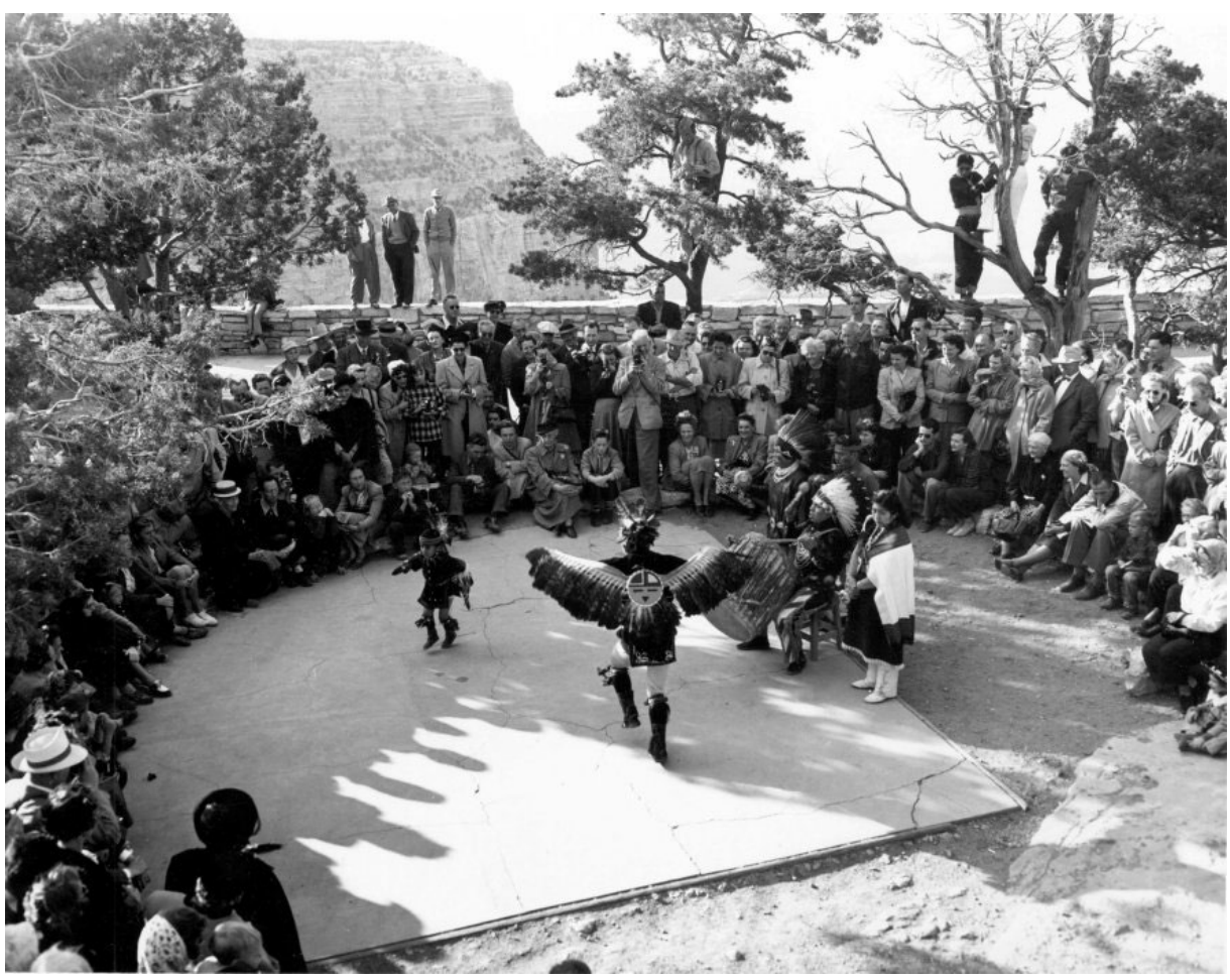
#01911: Hopi Eagle Dance being performed at the Hopi House, circa 1949.