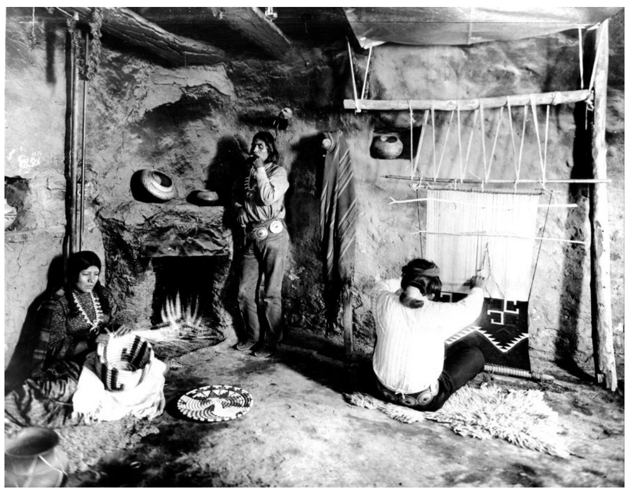
#09936: Native artists demonstrating at the Hopi House, circa 1910.