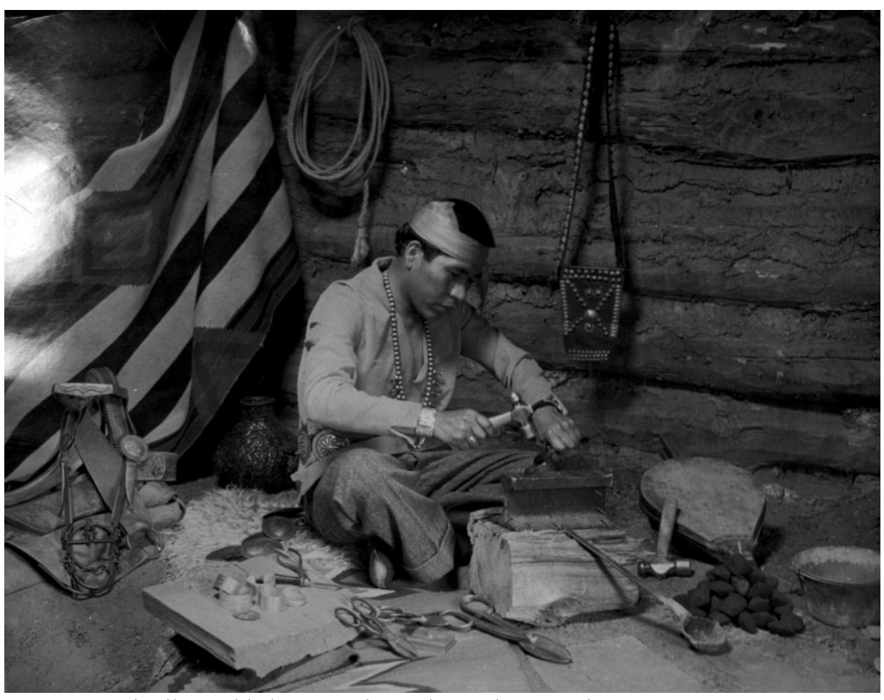
#07079: Navajo silversmith demonstrating at the Hopi House, circa 1940.