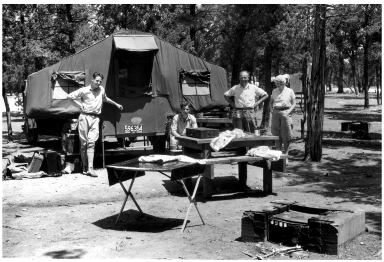
#12531A: Campers at the South Rim campground, July 1930.