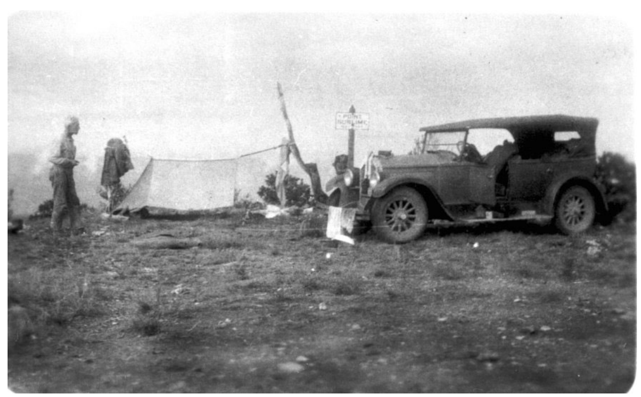
#16006: Camping at Point Sublime on the North Rim, circa 1925