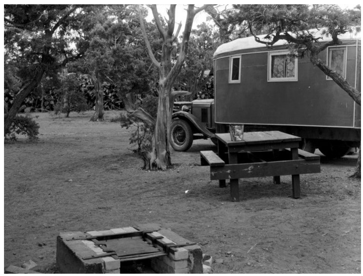
#06060: South Rim campground with an early mobile home, May 1936.