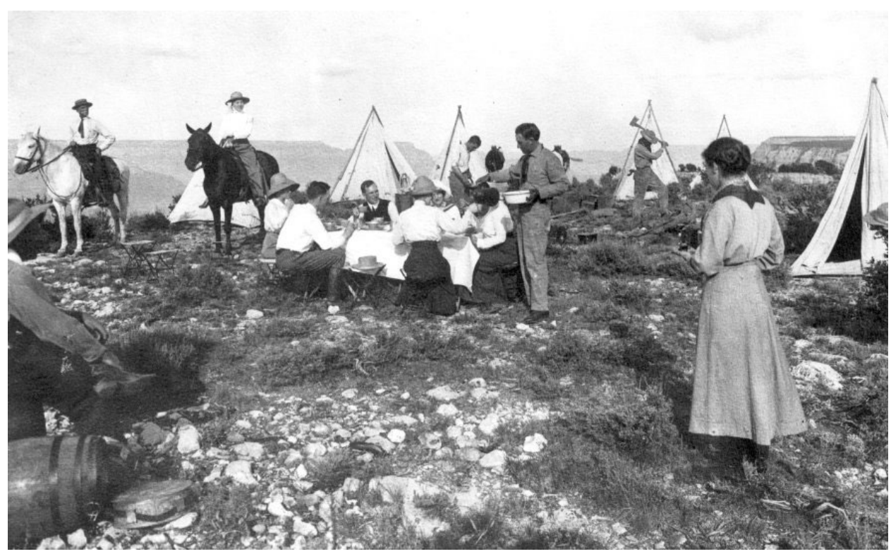
#07796: Photo titled "Camping on the Rim", circa 1910.