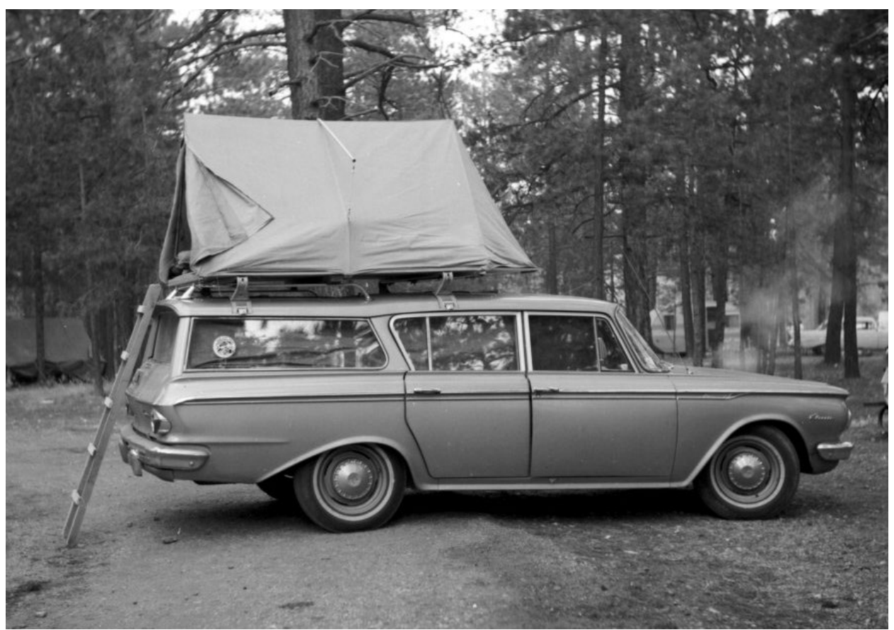
A camping style that has made a comeback in recent years... #04700A: New type of camping in a Rambler in the North Rim Campground, July 1964.