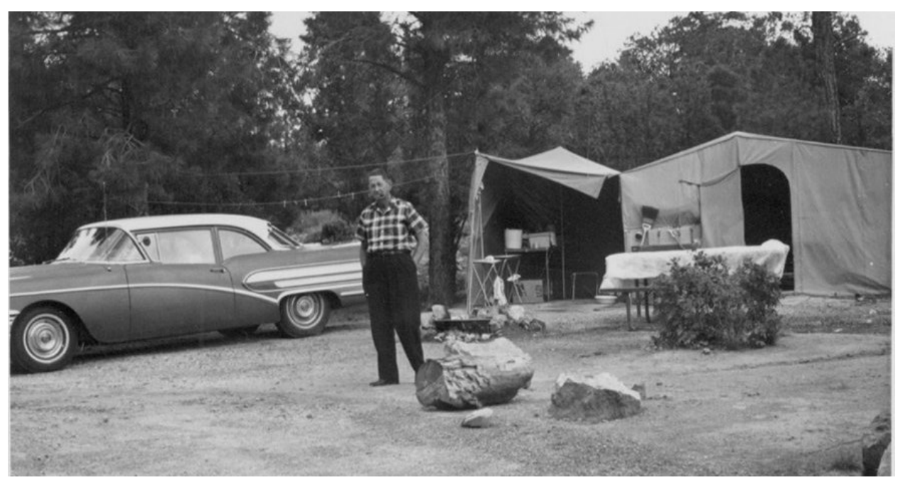
#04352A: Occupied campsite at Mather Campground, circa 1963.