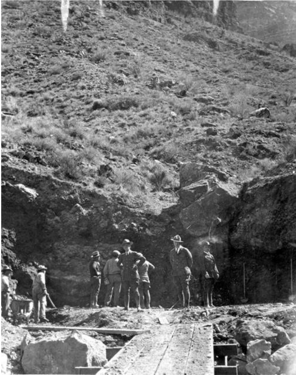
#00085: NPS OFFICIALS AT CONSTRUCTION SITE FOR INDIAN GARDEN WATER PIPELINE, CIRCA 1932.

Labor Situation: The labor situation in Arizona has been afforded small relief so far this spring. An increasing number of applications, most of them requesting any sort of work, are being received daily at the Park office. [The country was in the midst of the Great Depression at the time.]