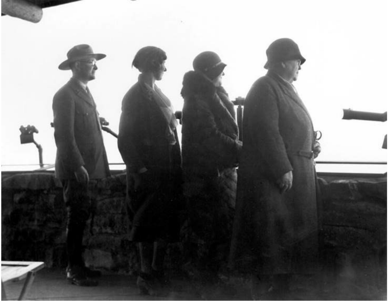
#00054: AT YAVAPAI OBSERVATION STATION, CIRCA 1932.

Flora and Fauna: The Spurred Towhee was recorded from the South Rim . These are the first winter records of this species from the park.