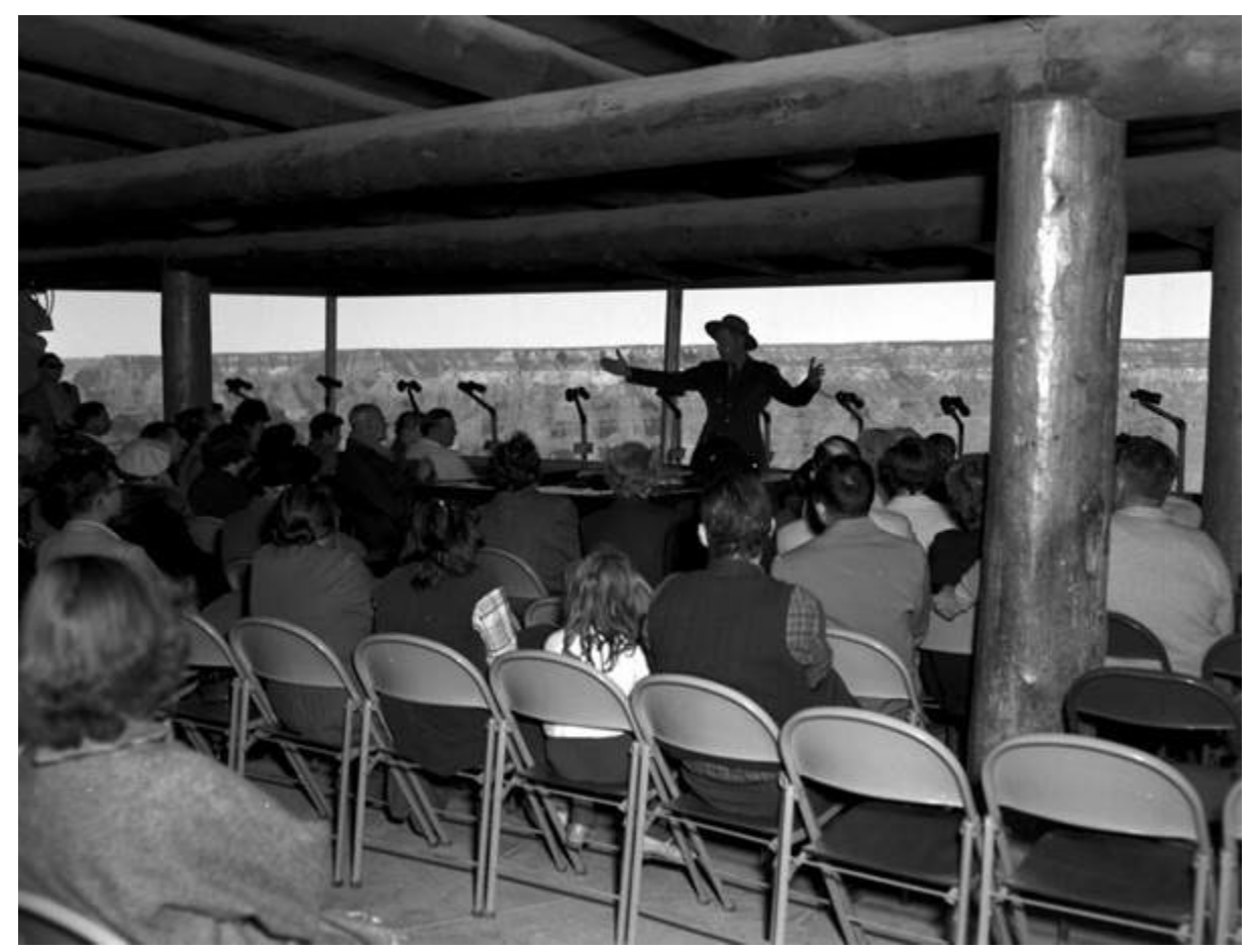
#09733A: NATURALIST GIVING A YAVAPAI MUSEUM INTERPRETIVE TALK, NOVEMBER 1953.