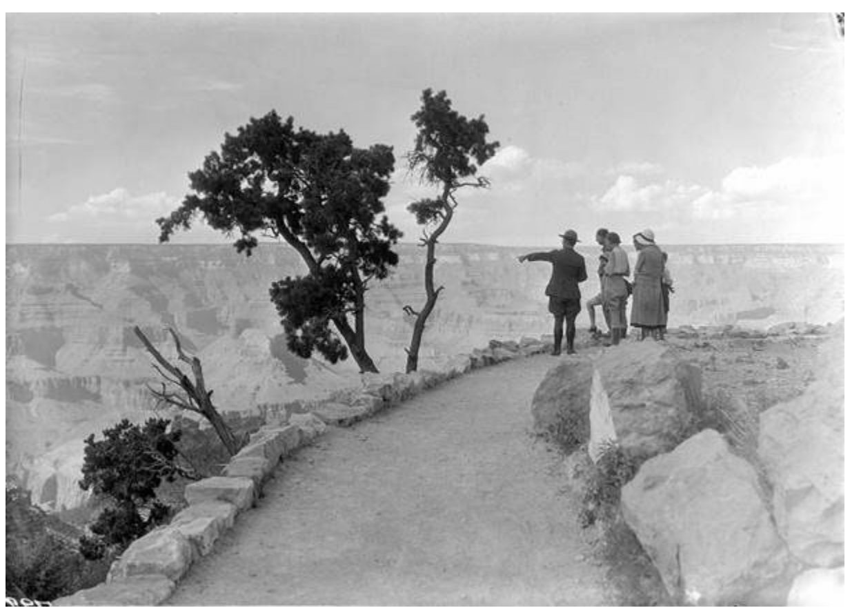
#00798: NATURALIST GUIDING A SMALL PARTY OF VISITORS ALONG THE RIM TRAIL NEAR KOLB STUDIO, CIRCA JULY 1932.

In honor of National Interpreter Appreciation Day this week, and the reopening of the Visitor Center after more than two years, a tidbit about past Interpretation at Grand Canyon.