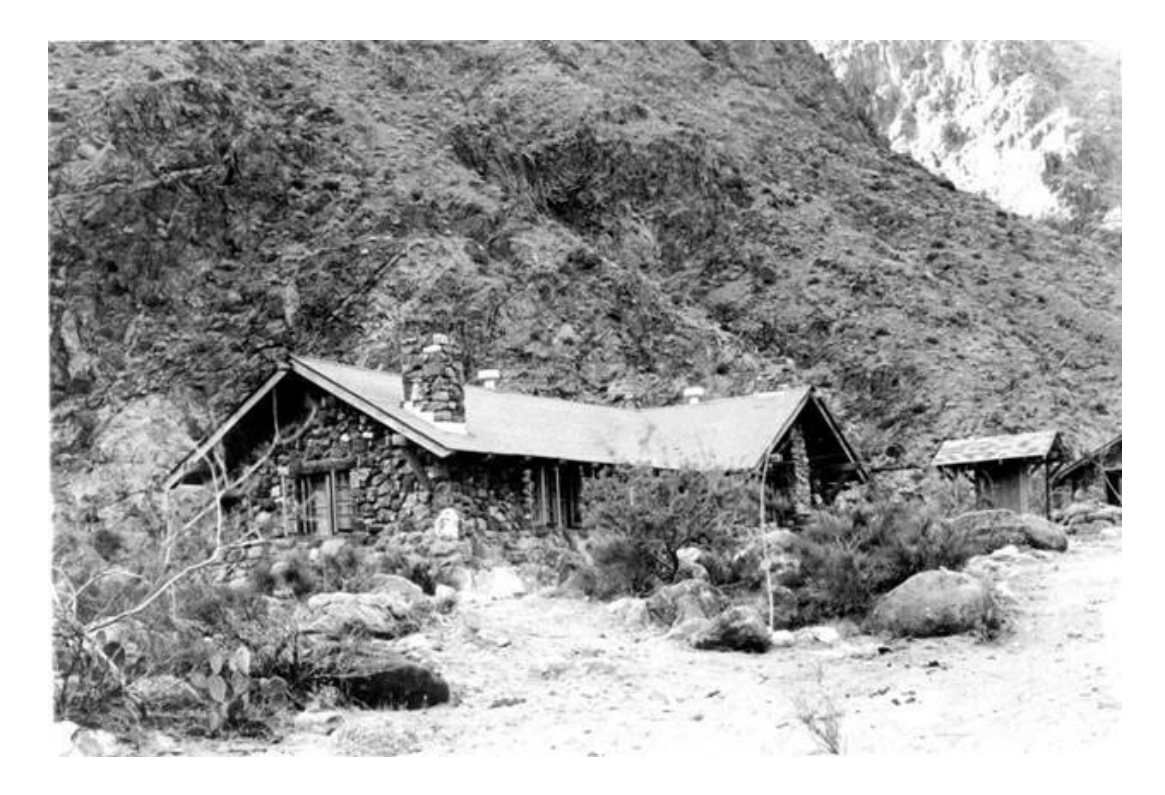
#04439: ORIGINAL PHANTOM RANCH LODGE BUILDING AFTER CONSTRUCTION, CIRCA 1922.