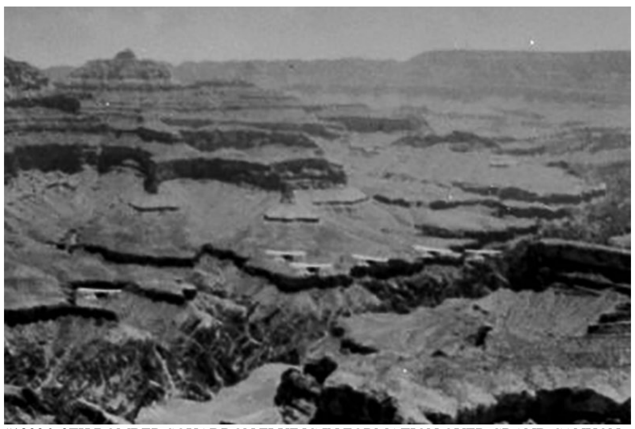
#12996: 9TH BOMBER SQUADRON FLYING IN FORMATION OVER GRAND CANYON, JUNE 29, 1932