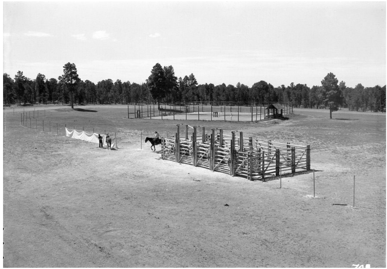
#00700: COMPLETED RODEO CHUTES AND CORRALS AND TENNIS COURTS IN THE COMMUNITY FIELD, JULY 1935

"This project consisted of completely rebuilding the battery of two tennis courts located in the recreational area [on the South Rim].