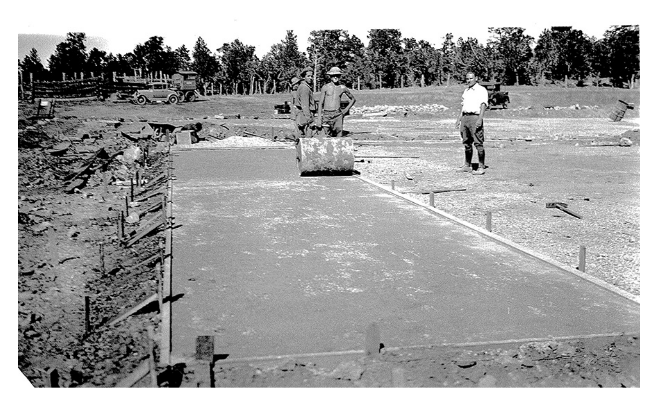
GRCA 29861: TENNIS COURT CONSTRUCTION, ROLLING FINISHED BASE, 1933