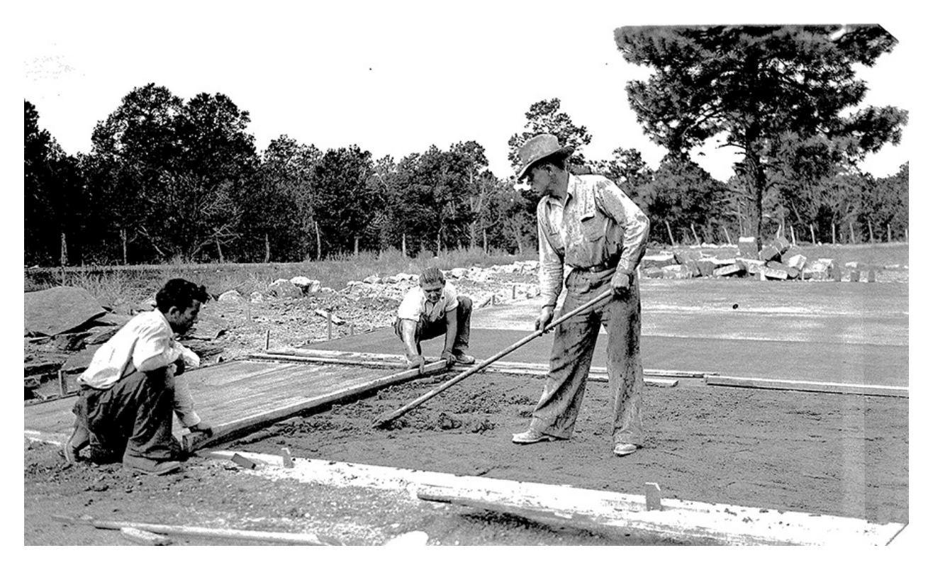
GRCA 29861: TENNIS COURT CONSTRUCTION, LAYING THE LAYKOLD BINDER, 1933\,