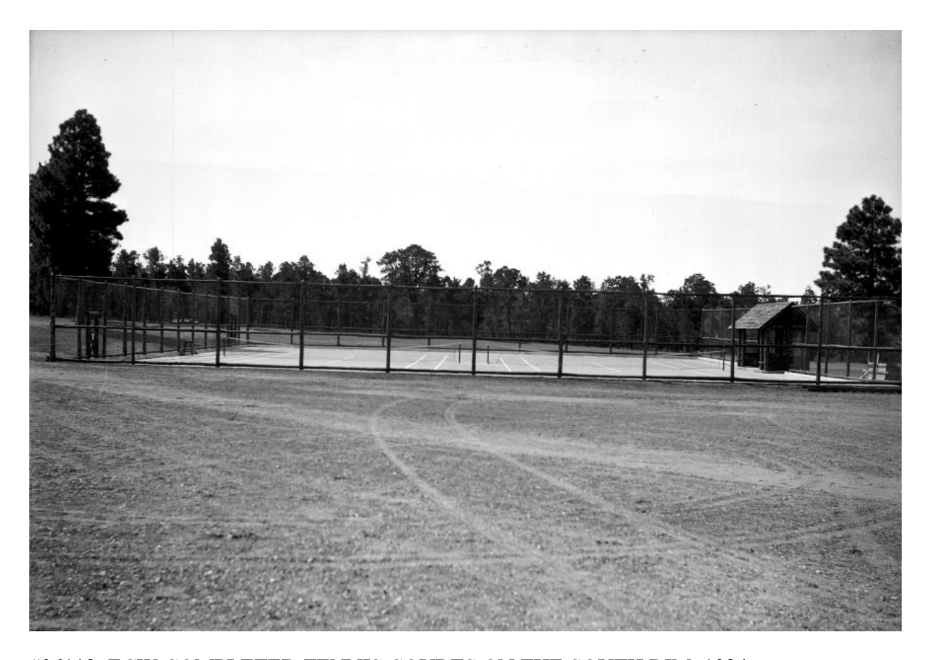
#06112: ECW COMPLETED TENNIS COURTS ON THE SOUTH RIM, 1934

featured hard, fast play and was applauded for the abundant show of sportsmanship. All matches were fought to the very last point and showed some very high ranking players."