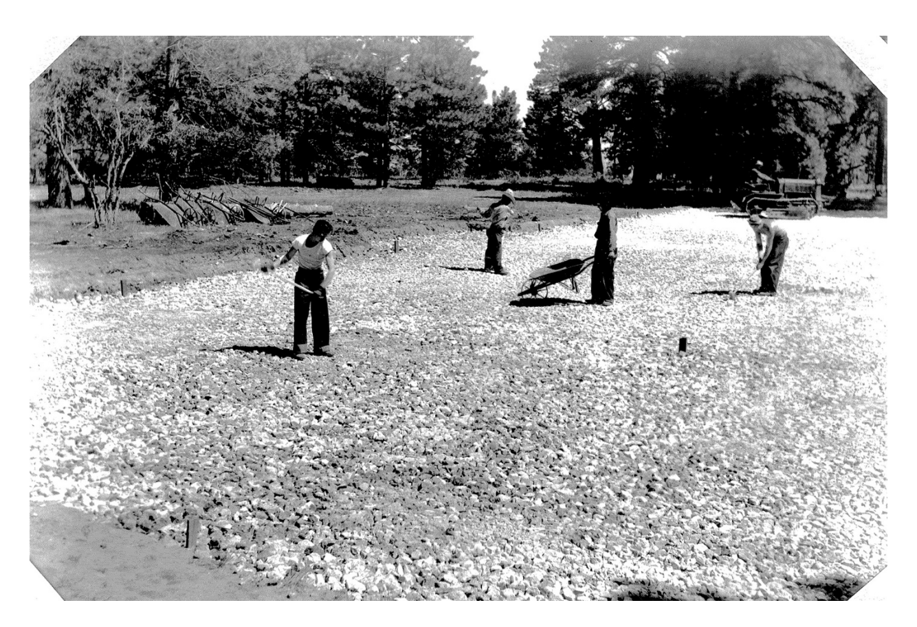
GRCA 29853: NORTH RIM TENNIS COURTS, CONSTRUCTING THE SUB-SURFACE, SUMMER 1936

The playing surface covers an area 105'x120'. Particular care was taken in the preparation of the subbase, and the laying of the surface material.