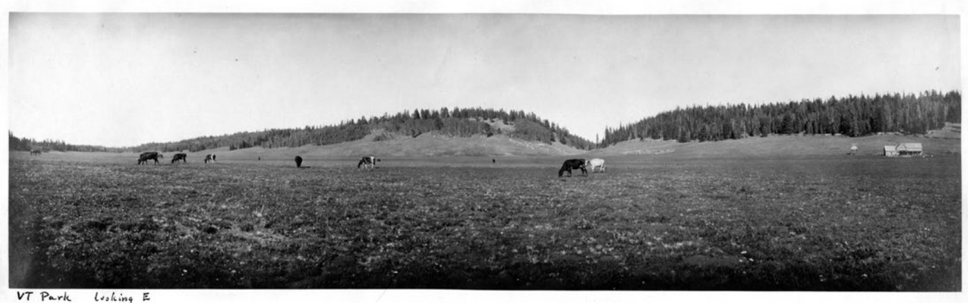
VT Park looking East.

easier grades. The Shaevits Plateau [sic]<sup>15</sup> to the west is from twelve to sixteen hundred feet lower, but has identical geologic features. The Hurricane Fault is one of the most interesting, because [it is] one of the longest and best-defined faults in the west. (Dutton) [sic].