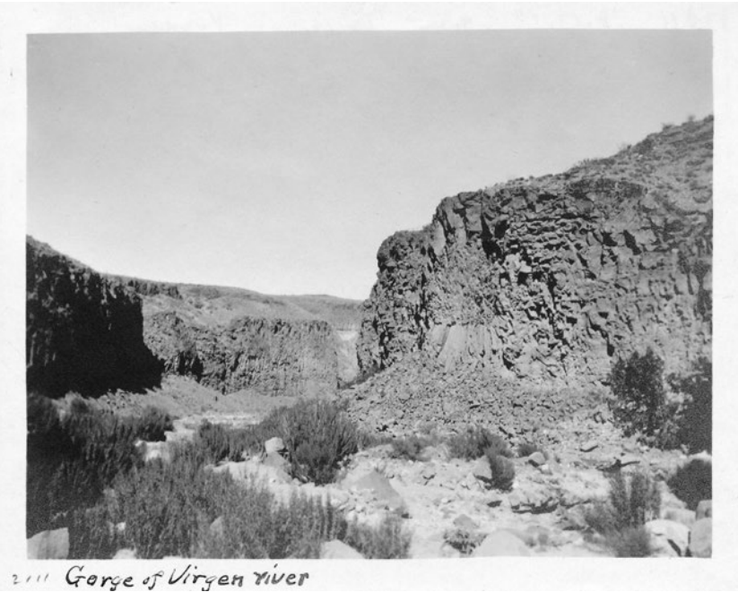
Gorge of Virgin River.

The present hard surfaced road goes almost directly east to Kanab and [the] Kaibab Plateau, but Ike took us across the Virgen River<sup>12</sup> to the small town of Hurricane (3500)<sup>13</sup> and we climbed up the steep Hurricane Ledge to the Uinkaret Plateau<sup>14</sup> twelve hundred feet higher. This got us at once into a cooler region with