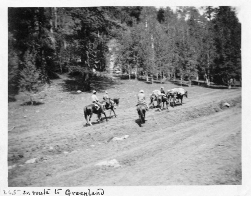
En route to E Greenland.

After returning from the east side, we went next to Point Sublime<sup>28</sup>, having the benefit of Uncle Jim's company, including the dogs. The point begins at an elevation of 8000 feet, rolling gently in the upper part, but nearly flat for the last half mile. There was an old camp site on the east side, close to an abandoned copper mine, and there we made our camp with an uninterrupted view to the south. On the west a long narrow ridge called Sagittarius, continuing as Scorpion Ridge<sup>29</sup>, ran parallel to Sublime [but] a little lower and so