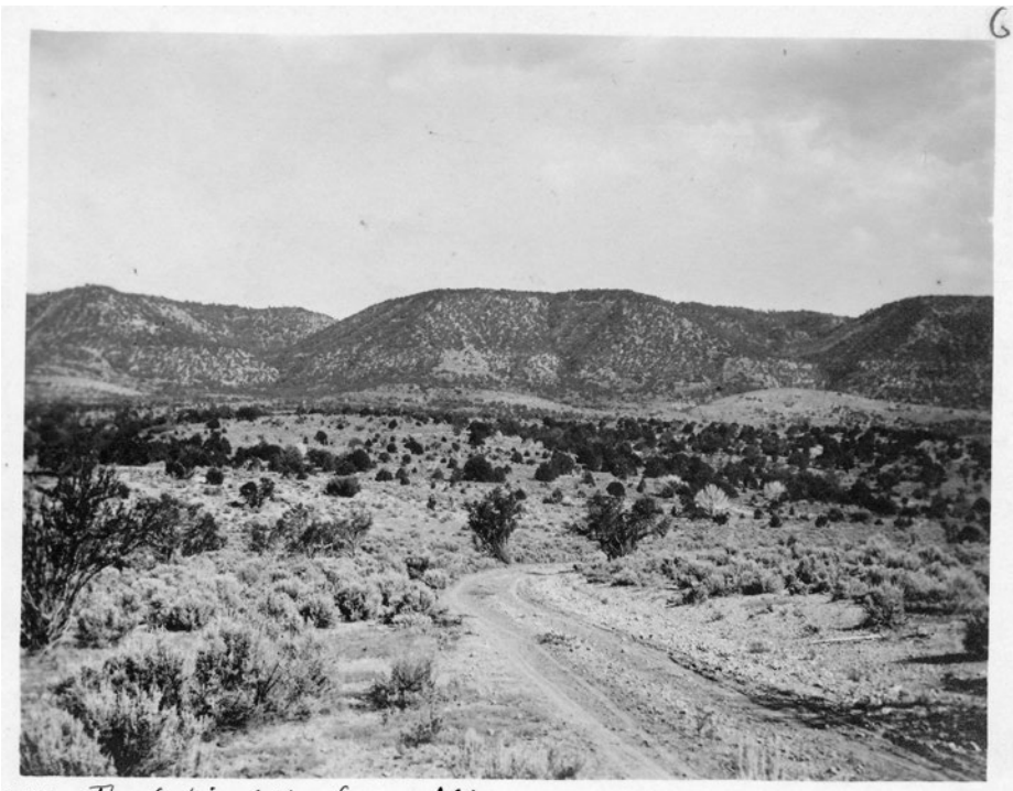
Buckshin Mts from W.