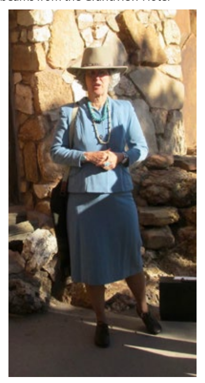
"Mary Colter" welcomes us to the Watchtower

Upstairs, we were given photographs of the original Native art and asked to find their counterparts on the walls. We were also told of the restoration work done by the Park Service. Since the supporting skeleton of the Watchtower is steel, the steel expands and contracts, which caused the walls to crack and the salt in the cement to leach onto the paintings.