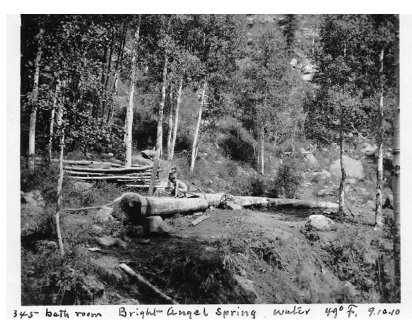
Bath room Bright Angel Spring water 49 degrees F 9.10.10.

surroundings as far as Bright Angel Point (8135), made plans, and assembled supplies for the next trip. Planning trips of three to five days each we assembled food the day before, packed beds and duffel bags as soon as we were up and while breakfast was cooking; gathered horses and mules; ate breakfast; saddled the animals and soon after breakfast would be off. Bert and I formed the rear guard and looked out for strays or dropped articles. If we expected a long ride the first day we put lunch goods at the top of a pack. Every one had an iron ration of malted milk tablets, chocolate, raisins and chewing gum. On the Plateau it was not necessary to carry canteens and drinking water. In the rare event we expected a dry camp, or one more than half a mile from water, we carried a ten gallon keg and filled it at the last spring.