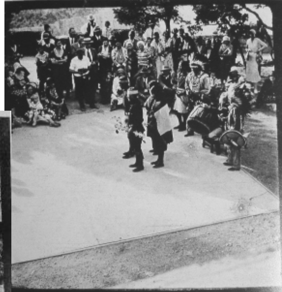
Just a step from El Tovar is the Hopi House, where Indian dances are a daily attraction.