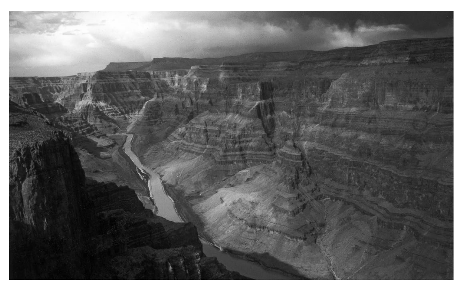
Looking downstream from Quartermaster Point