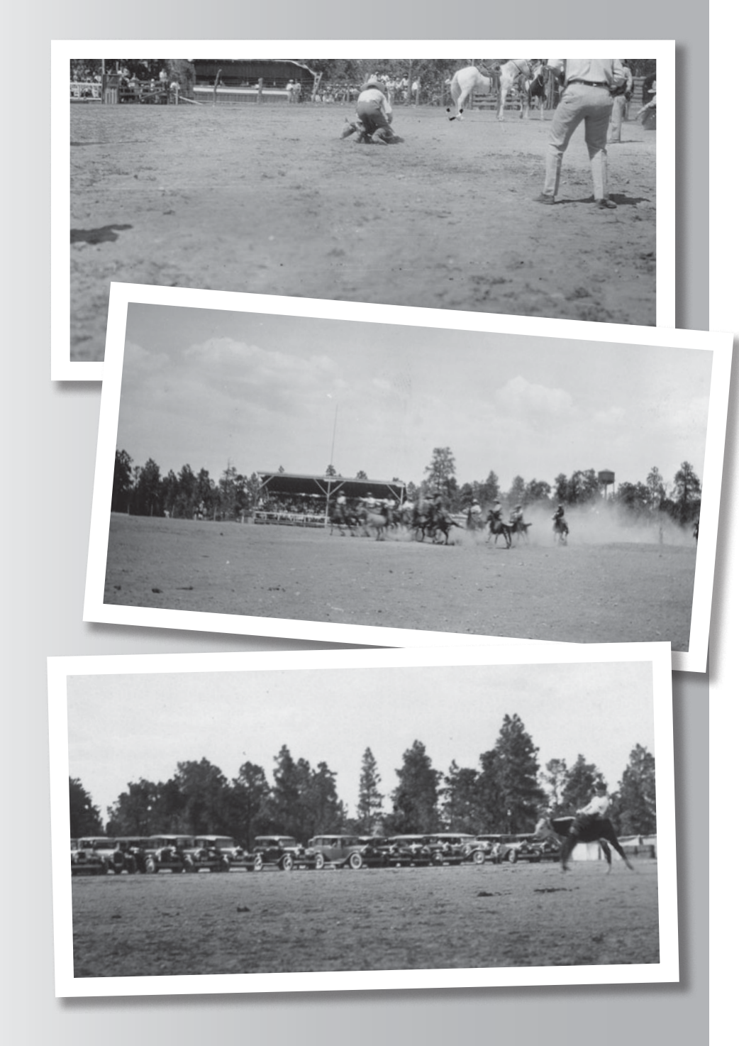
Grand Canyon 4th of July Rodeo

I don't believe the Indian Field Days event was ever approved or held, but it is fun to read about what the community was trying to do to draw more tourists to the Grand Canyon!