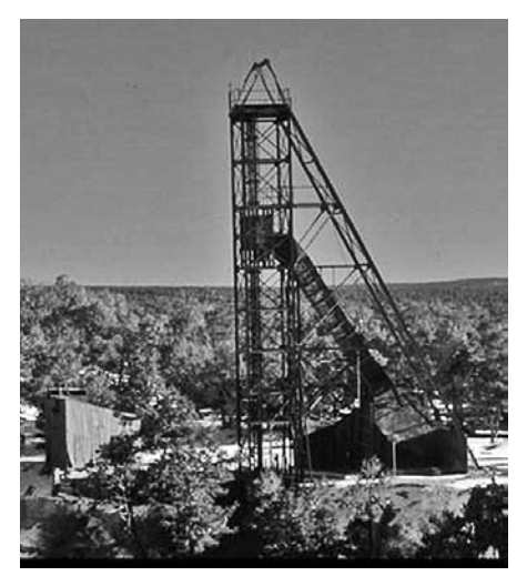
The Orphan Mine headframe stood at the south rim for more than 50 years.

emember the big headframe, part of the Lost Orphan Uranium Mine, that could be seen on the South Rim between Maricopa and Powell Point? When the mine was operating, Christmas lights were strung on it for the holidays making it look like a giant Christmas tree on