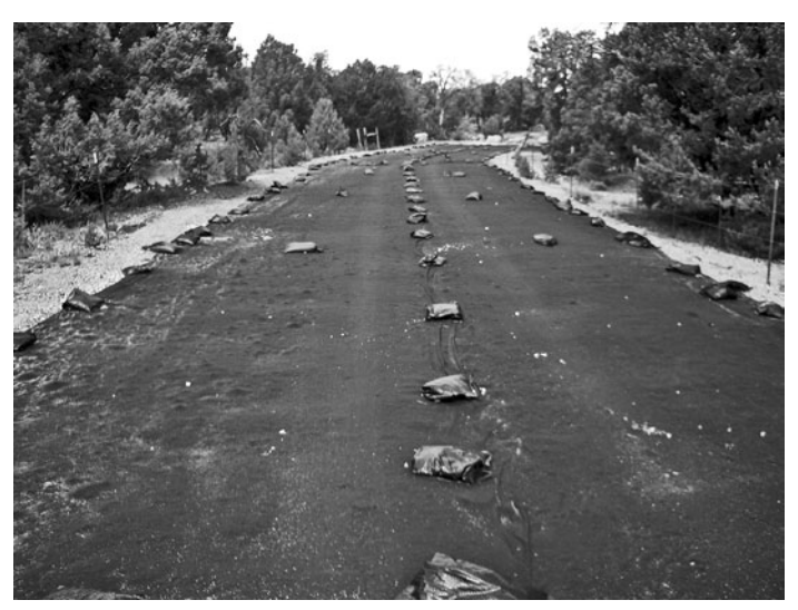
Synthetic fabric is held down by sand bags to keep radioactive dust and other contaminates contained.

Cleaning up the Lost Orphan Mine site will be a major undertaking. Radioactive tailings and dust have apparently contaminated much of the area. The Park Service has invoked the Comprehensive Environmental Response, Compensation and Liability Act (the "Superfund Law") as a