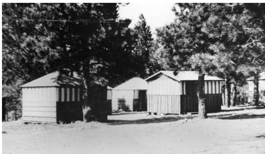
Wylie Way Camp cabins near Bright Angel Point on the North Rim, 1916–1927.