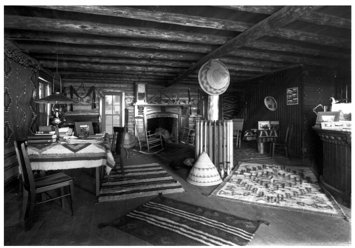
Interior of the Grandview Hotel lobby. Circa 1905. Detroit Photographic. Photo–Grand Canyon National Park #12090

land, the NPS made a thorough inventory of its contents, including its 928 ponderosa pine trees, its 35-yearold horse, and its 7,123 feet of fences made of five-strand wire and steel posts. There was a highly detailed list of all the buildings, including Pete Berry's original cabin, now expanded to 750 square feet at a cost of about $2,000 for use by Hearst's caretaker Dick Gilliland (it was probably this cabin that was incorrectly identified as Morgan's cottage). The NPS inventory made no mention of any Julia Morgan cottage. Longtime Grand Canyon postmaster Art Metzger, who lived through the Hearst era, recalled for NPS interviewer Julie Russell that Hearst never built anything at Grandview, although Dick Gilliland did fix up his cabin "pretty nice." Hearst documents indicate that he spent a total of $4,715 on improvements at Grandview, nearly half of which would have been for improving Gilliland's cabin. In 1926 Grand Canyon