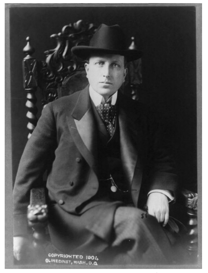
William Randolph Hearst, 1904.

William Randolph Hearst also had something to conserve at the Grand Canyon. In 1913, six years before the establishment of Grand Canyon National Park, Hearst bought some beautifully forested land on the rim at Grandview. For the next quarter of a century Hearst fended off the National Park Service, which wished to acquire Hearst's land but lacked the political muscle to take it away from him. Then in 1939 the Roosevelt administration threw its full weight into the effort to take Hearst's land, and the result was an epic struggle. It would be the only time in the history of Grand Canyon National Park that